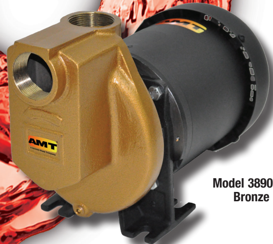
Model 3890-97 Bronze