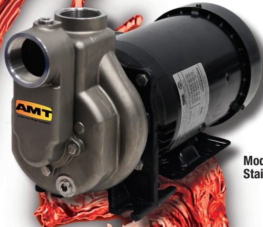
Model 389A-98 Stainless Steel